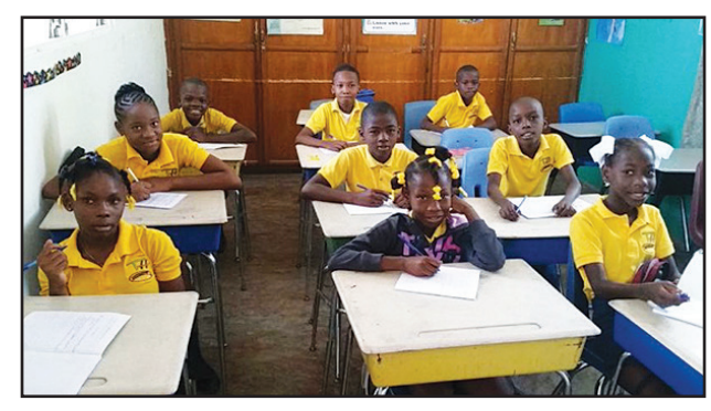
New classroom for young Haitian children.

For more info about TeacHaiti, visit http://www. teachaiti.org.