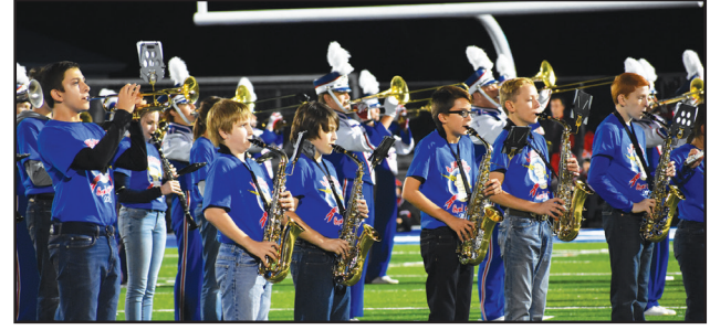
Eighth Grade Band Students enjoyed joining the Lake High School Blue Streak Marching Band for their annual performance at Middle School Band Night.

The Lake Middle School 8th Grade Band has just completed their annual performance with the high school marching band as part of Middle School Band Night on Friday, September 21. The students joined the high school marching band for the entire evening, including marching to the stadium and sitting in the stands. 245 Lake Band students in grades 8-12 were on the field for the halftime performance. This is a very educational "first taste" of marching band for