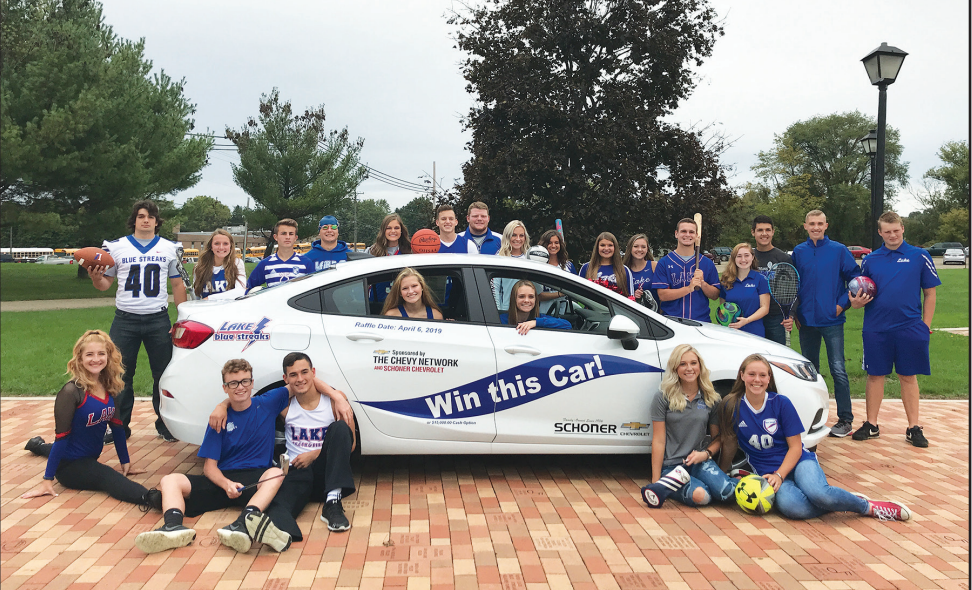
Lake athletes from all sports are selling raffle tickets.