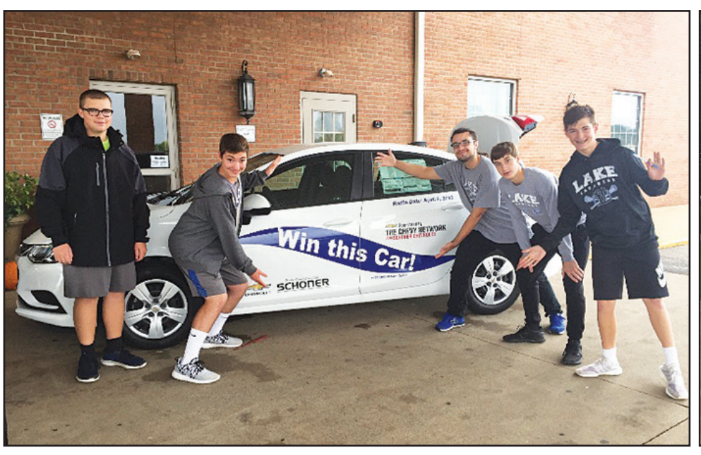
Lacrosse boys sell raffle tickets.