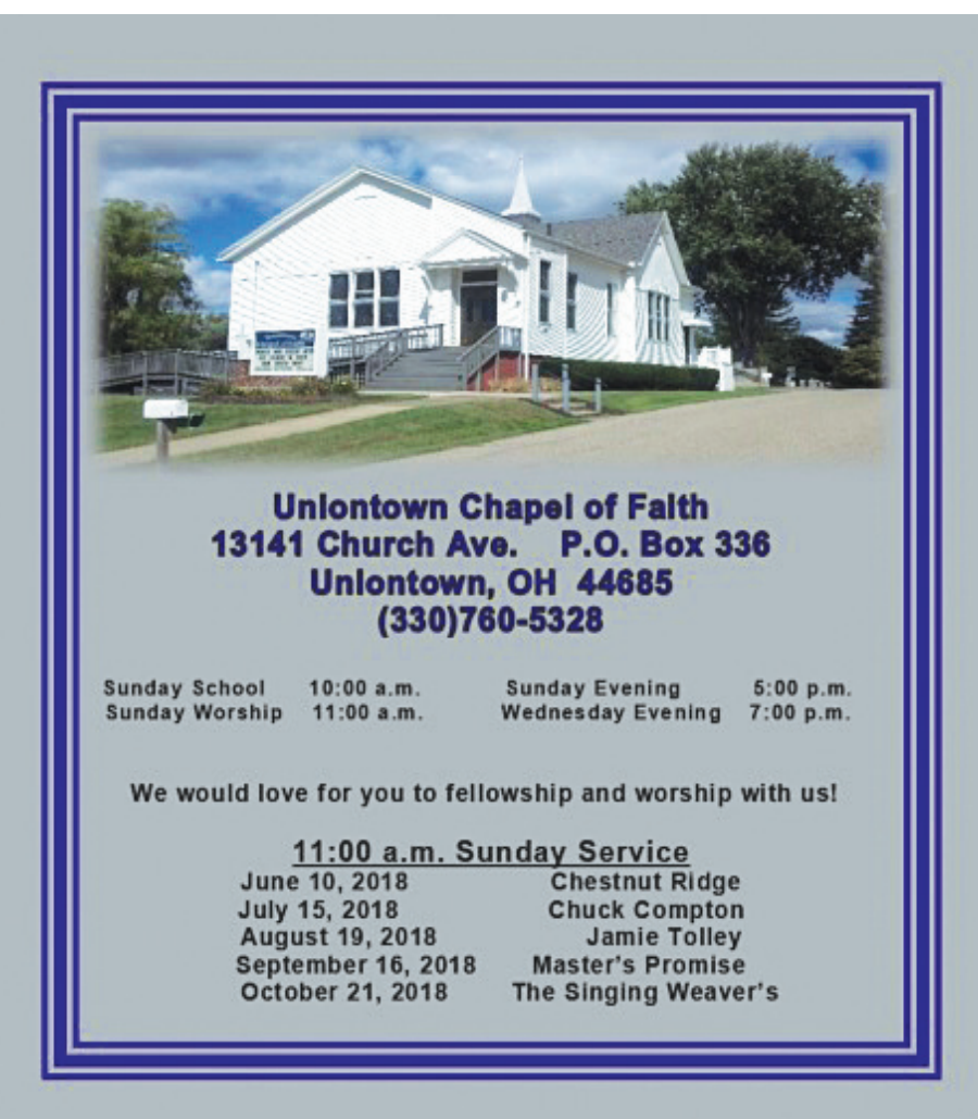
6 BLUE STREAK NEWS