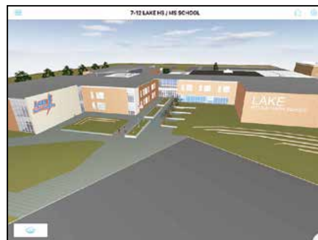
Concept/subject to change: Main entrance of new addition to HS/LMS building, looking west from Market Ave.