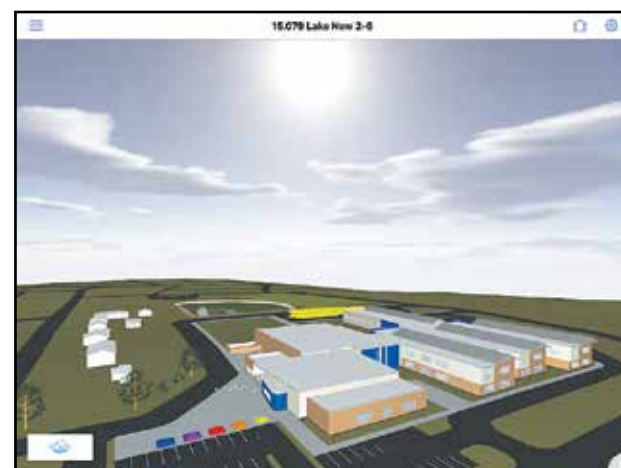
Concept/subject to change: 3D aerial image of grades 2-6 building.