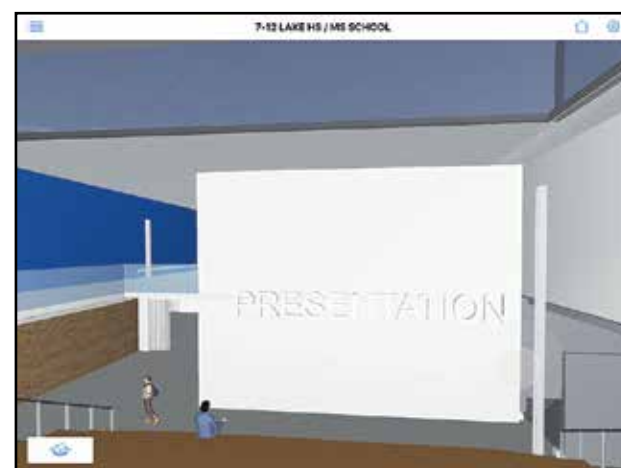
Concept/subject to change: Large group instruction area with presentation screen at HS/LMS building.