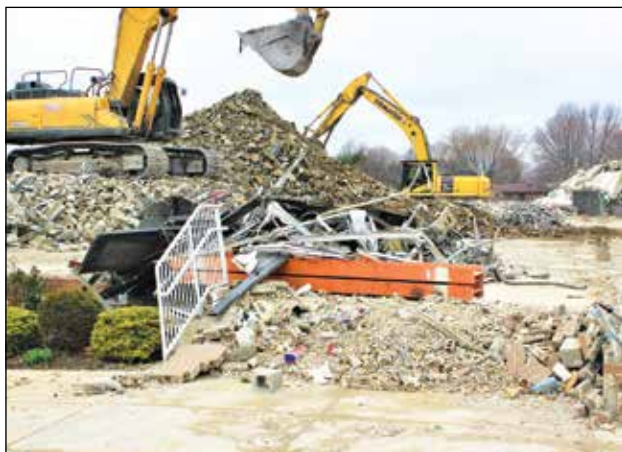
Demolition progress as of March 21, 2019.