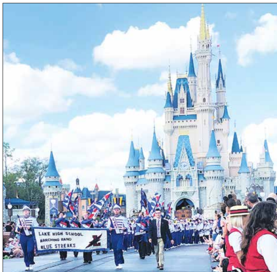
The Blue Streak Marching Band walks by Cinderella's castle.