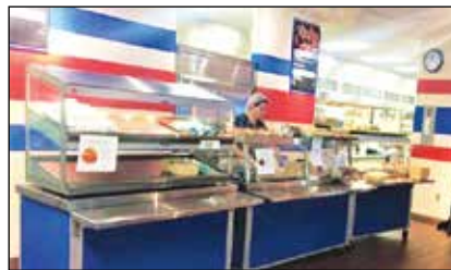
Serving students lunch at the Lake Middle High School cafeteria.

Students and staff are settling into our newly remodeled home at the Lake Primary building. In the kitchen area, we've added a new sprinkler system, lights, and fresh paint. We are enjoying the much larger cafeteria/dining area available to us in this beautiful building!