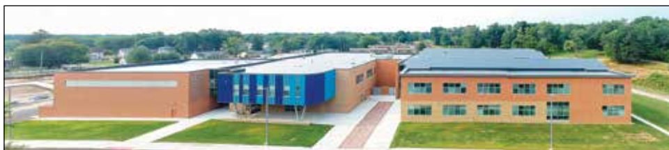
The highlight of the central walkway to the building is the decorative concrete strip.