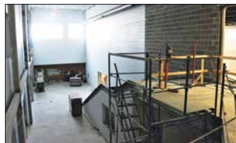
From top of staircase, looking north.