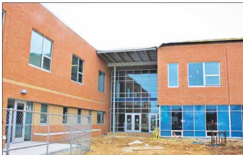
New main entrance to Lake Middle/High School.

continue into the beginning of summer. Once the building is removed, contractors will begin site-work to create additional parking lots and green space by the fall of this year.