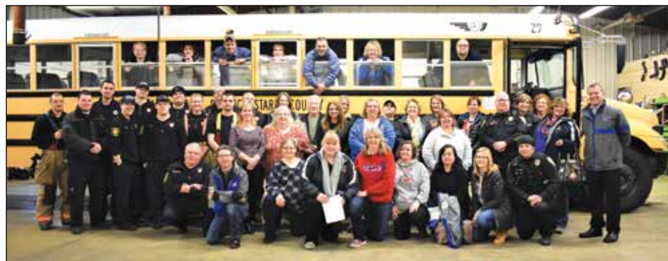
Recent bus training was collaborative effort.

New construction work continues on our Lake Middle High School on the eastern expansion which will provide a new two-story main entrance facing Market Ave. Including office spaces and the middle school gym, this east wing is scheduled for completion by December, 2019 at the latest. Once completed, the Lake Middle High School will include 110,123-square feet of new construction, and 64,000-square feet of remodeled classroom space. The above areas are in addition to the central complex of the building, which was completed in 2001 and has remained untouched.