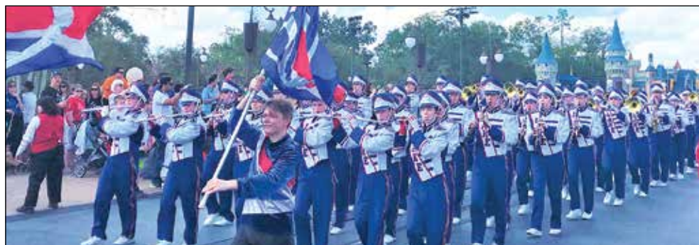
Walking down Main Street, U.S.A. in the Magic Kingdom Parade was a highlight for the Blue Streak Marching Band.