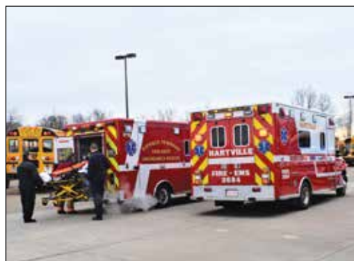
Local Fire/EMIS units also participated in the event.

Thank you again, to our local fire and police departments, and all Lake staff involved, for their support and participation in this valuable, helpful training event!