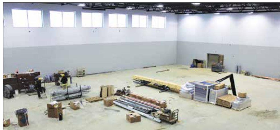
The new gymnasium is taking shape.

Unlontown Chapel of Falth 13141 Church Ave. P.O. Box 336 Unlontown, OH 44685 (330)760-5328