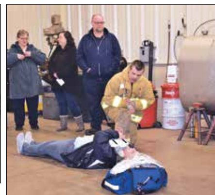
Assisting a “victim” during the training.