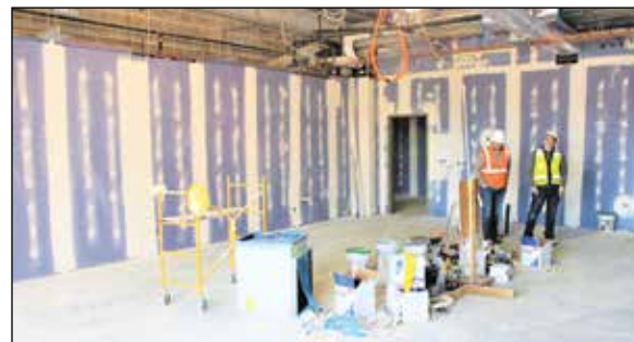
A classroom under construction.

continue into the beginning of summer. Once the building is removed, contractors will begin site-work to create additional parking lots and green space by the fall of this year.