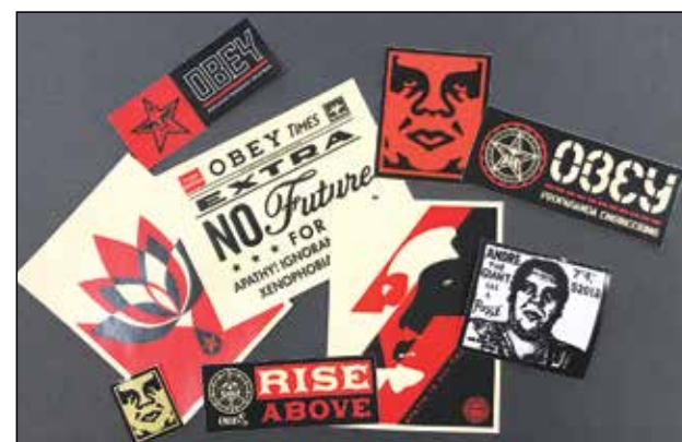
Two packages of stickers arrived by mail.