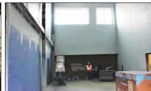
Natural light brightens two-story hallway.