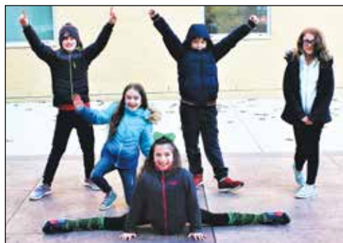
Third graders pause over concrete.

One 2004 Lake graduate who completed his entire school career from Kindergarten through to graduation as a Blue Streak, was able to give back to his alma mater in a concrete way – literally.