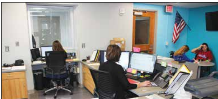
The reception area for grades 7-9.

Walk inside Door 2 at Lake Middle High School, and you will see that the former high school administrative offices are just one of many places throughout the building that have undergone a makeover. (Note – the new administrative offices are located in the recently completed east addition of Lake Middle High School, close to what will be the new main entrance facing Market Ave.) The area is now a counseling suite for counselors grouped together by grades 7-9 and 10-12. It includes two large existing conference rooms used for IEP meetings, staff meetings, and large student groups. The new counseling offices are now sized to allow for smaller group, or individual one-on-one discussions with staff.