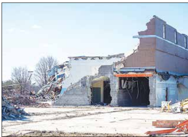
Demolition of former middle school as of March 17, 2019.