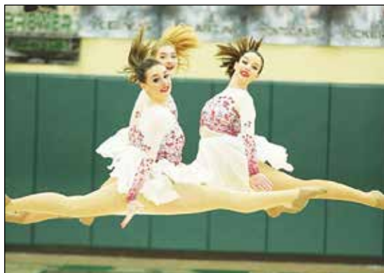
Lake Dance Trio