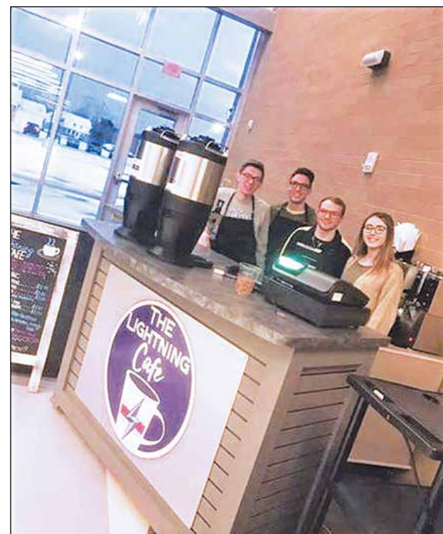
Stop for an early morning cup of coffee at the Lightning Café by Door 1E.